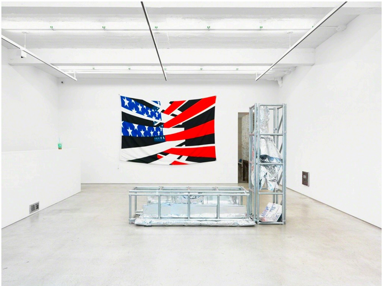
Installation view of "Efficient Frontier" at Magenta Plains, 2016.