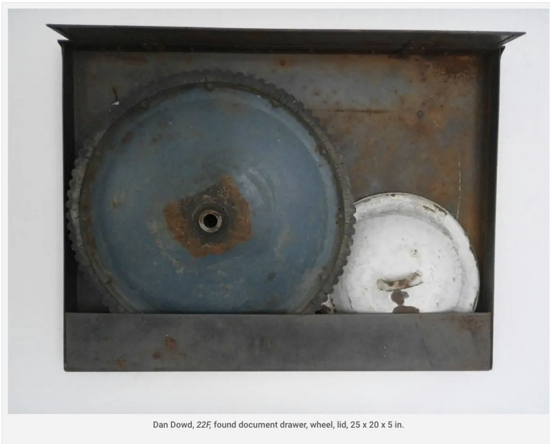
Dan Dowd, 22F, found document drawer, wheel, lid, 25 x 20 x 5 in.

The second and more frequent event was our Saturday morning trips to the town dump. It was on these trips that our father would drop my brother and sister and me off at the metal scrap pile while he threw things away. We would search for shiny or rusty hubcaps and other metal things that caught our eye. We also were allowed to explore the burn pile if it was not smoking and would occasionally unearth a melted bottle or strange hulk of disfigured plastic.