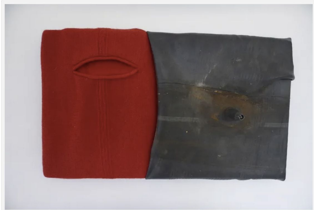
Dan Dowd, Untitled , found fabric, truck tire inner tube rubber, 12 x 7 x 3 in., (Collection of the University of Maine Museum of Art).

My most recent series stems from an attempt at spring cleaning a few years ago. I was trying to make some space in my closet and kept coming up against shirts or sweaters that I loved but never wore. I wondered and thought about this for some time and ultimately decided to bring these items into my studio. It was my way of letting them “live on.” Some of the fabrics that I find resemble things that I may have desired as a child but ultimately never had. Some of the fabric can feel a certain way or be a color that signals me to use it.